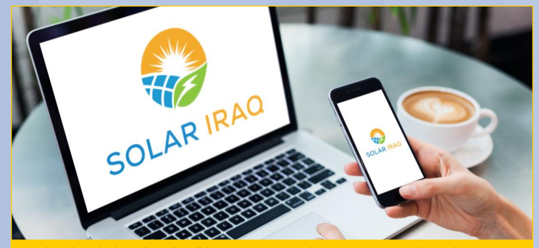
The Solar Web Portal is designed to work on all devices to ensure interested individuals can access it at home and on the way.

In September 2023, Solar Iraq, an interactive web portal, was developed and launched to consolidate the newly available PV expertise, services, and directories into one comprehensive ecosystem. This online platform serves as a connecting resource for energy professionals, enthusiasts, and clients interested in clean energy solutions in Iraq. It offers a wealth of information on PV and energy efficiency applications, market developments, and directories for PV trainers, training institutions, energy consultants, and companies operating within the solar energy sector in Iraq and the Kurdistan Region of Iraq (KRI). Therefore, this digital space promotes the growth and adoption of solar PV technologies in the country. Solar-Iraq is a multilingual resource available in Arabic, Kurdish, and English at the following link: https://solar-iraq.com/.