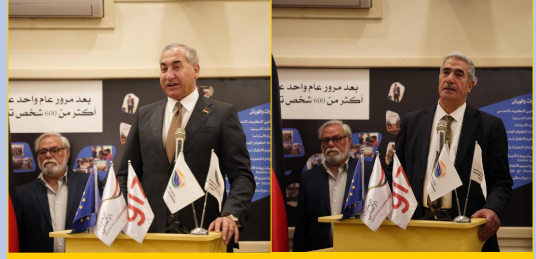
The Deputy Ministry of Environment and the Senior Advisor to the CBI expressing their support during the opening ceremony