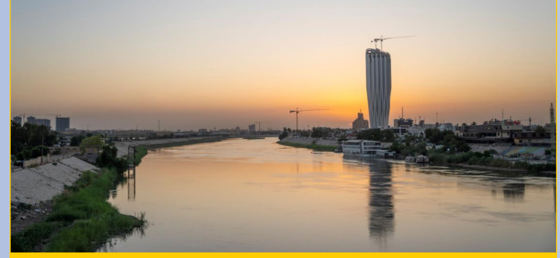
Baghdad is the main business hub for central Iraq and home to many companies offering services to citizens and in demand for electricity

Baghdad Solar Training Centre, Baghdad, Mansour, Baghdad international Fair, Baghdad Renewable Energy and Sustainability Centre (BRESC)