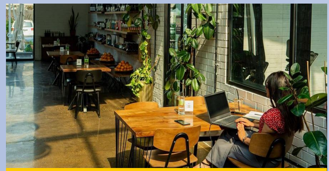
360: a green oasis in the middle of the dusty city offering healthy and sustainable products and services.