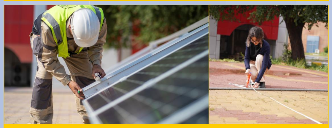
New equipment is being installed by local experts and under the supervision of international professionals from RENAC