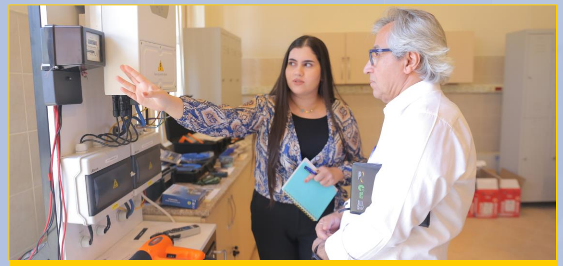
The founder of Culture Factory in Sulaymaniyah during a tour in the centre with one of the UoS staff members

KRI Renewable Energy Training Centre, Kurdistan Region of Iraq – Sulaymaniyah Kirkuk Road, the University of Sulaymaniyah (UoS)